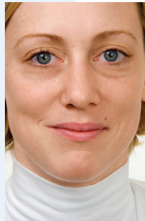
After Obagi-C Rx treatment (10 weeks)

As with the Nu-Derm®, Obagi-C™ Rx can slightly lighten the skin colour. Therefore, there is also a Professional C Serum that can be used for people who do not want any skin lightening. The Obagi-C™ Rx system gives a good improvement in skin texture and appearance but without so much of the side-effects that are seen with the Nu-Derm®.